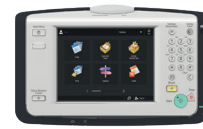
Upright Control Panel