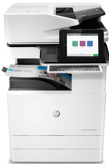
HP Color LaserJet Managed Flow MFP E77822z