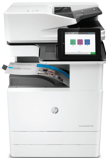
HP Color LaserJet Managed MFP E77822dn

Businesses that stay ahead don't slow down. It's why HP built the next generation of HP Color LaserJet MFPs—to power productivity with a streamlined design that delivers premium color value, maximum uptime, and the strongest security. 1