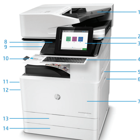
HP Color LaserJet Managed Flow MFP E87660z