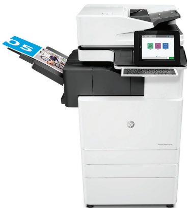
HP Color LaserJet Managed Flow MFP E87660z

*Purchase of optional paper trays and output accessory availability varied by device