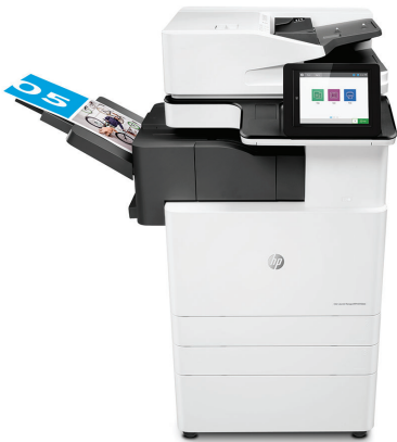
HP Color LaserJet Managed MFP E87660dn

Businesses that stay ahead don't slow down. It's why HP built the next generation of HP Color LaserJet MFPs—to power productivity with a streamlined design that delivers premium color value, maximum uptime, and the strongest security. 1