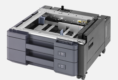
2x 500-Sheet paper feeder PF-7100

Ideal for paper sizes between A6 and SRA3 (320 x 450 mm).