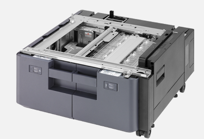
2x 1500-Sheet paper feeder PF-7110

Ideal for paper sizes between A6 and SRA3 (320 x 450 mm).