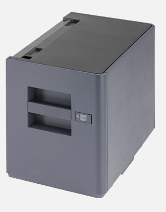
3000-Sheet paper feeder PF-7120