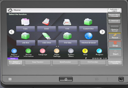
TASKalfa 9003i / 8003i / 7003i